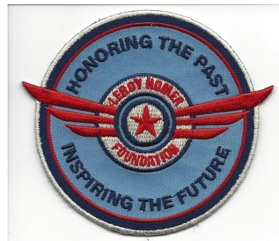
Commemorative Patch $5 + Shipping

To purchase any of these items go to leroyhomer.org and click on "Shop"