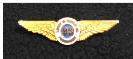
Lapel Pin $5 + Shipping